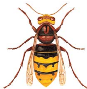
Native hornet ( Vespa crabro )